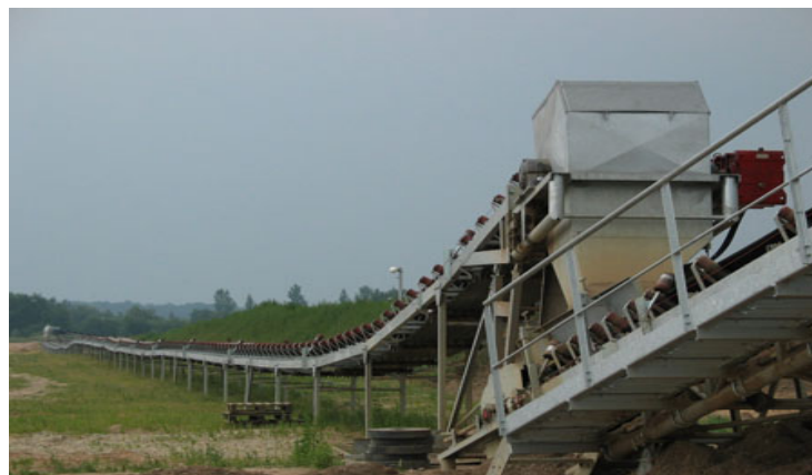
Figure: belt conveyor

The quarry will serve exclusively as a supply base for the proposed CEMCORP cement plant. After loading of fragmented rock, the material shall be transported by large-capacity trucks (dumpers) to the processing by means of crushing (by hammer crusher) to the required output size. From here, the processed raw material shall be transported by the belt conveyor to further processing at the cement plant.