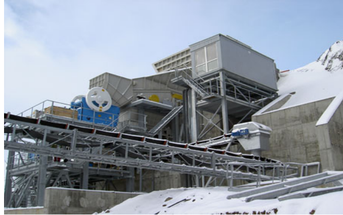
Figure: primary crushing

In addition to qualified equipment operators and servicing (fuel, repairs, transport of explosives, etc.), it will probably also be necessary to provide equipment so as to fragment boulders (jackhammer), and possibly other equipment.