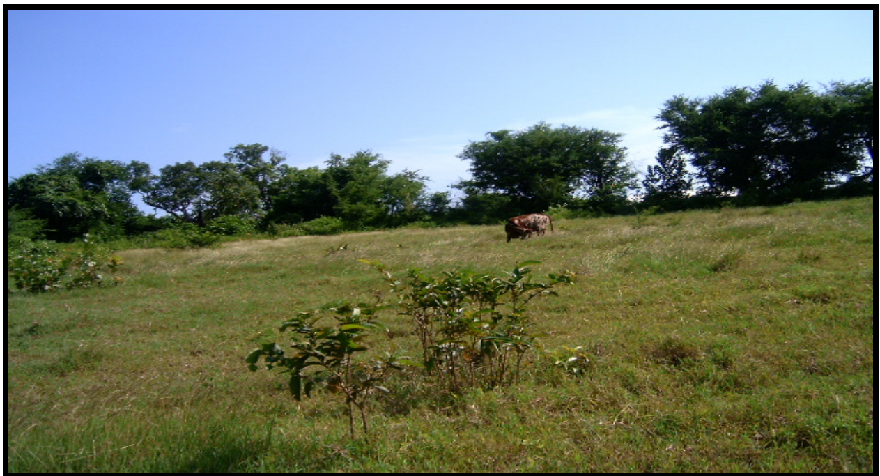
Plate 10: Cow grazing at the site of the proposed West Palm Memorial Gardens

The property is zoned by the Westmoreland Development Order 1978 (amended in 1991) for agriculture, while the Savanna-la-mar Development Plan (1998) developed by the Town Planning Department recommended that it be used for commercial activities or public buildings. However, the dominant land use presently on the property is open space/agriculture (informal cattle grazing). The adjacent land uses are institutional (south), commercial (west), cemetery (south) and residential (north and east).