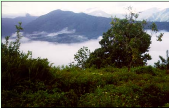
View of National Park at Blue and John Crow Mountains

In collaboration with private and public sector groups, create and maintain a system of protected areas which is managed for the benefit of the public.