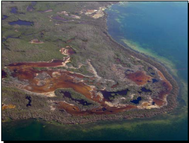
Portland Bight Protected Area