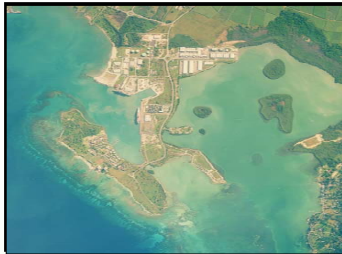
View of Montego Bay Marine Park