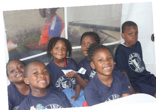
Students from Alpha Infant School enjoying the festivities