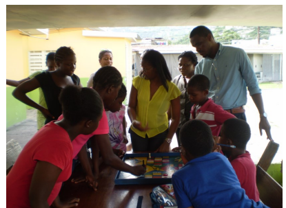
NEPA Visits NEST Children's Home