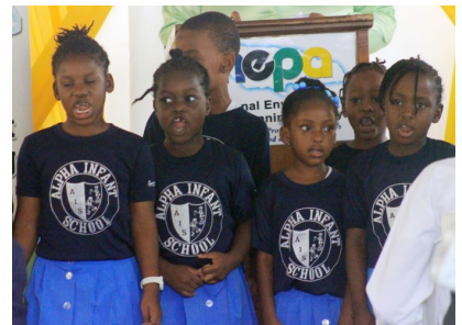
NEPA Hosts Open Day