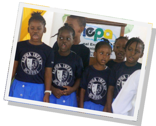
Students from Alpha Infant School performing at the Open Day