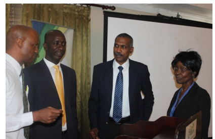
Working to Improve Air Quality