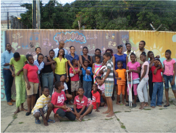
NEPA's members of staff taking a photo with residents of the NEST Children's Home

I t's not usually the big gestures that are the most heart-felt; small acts of kindness are exceptionally heart-warming