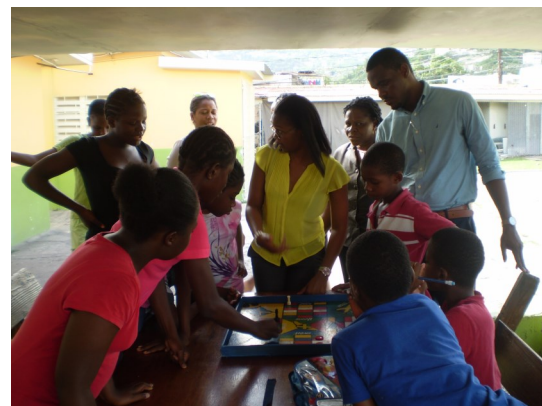
NEPA members of staff interacting with residents of the NEST Children's Home

The children were also provided with small "after-school" treats, which consisted of sandwiches, juice and pastries. The NEST Children's Home was also presented with toiletries, canned food and a pressure cooker.