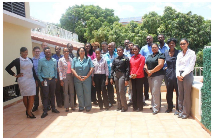
Participants from the private and public sector who participated in the recent Data Validation and Air Quality Index Workshop takes a group photo.

The information that will be provided by the Air Quality Index is meant to help citizens, especially high risk groups such as those with pre-existing heart and respiratory illnesses to make informed decisions, so as to reduce their exposure to poor air quality.