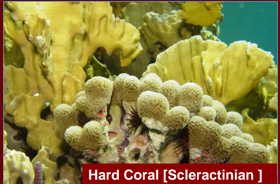
Hard Coral [Scleractinian ]