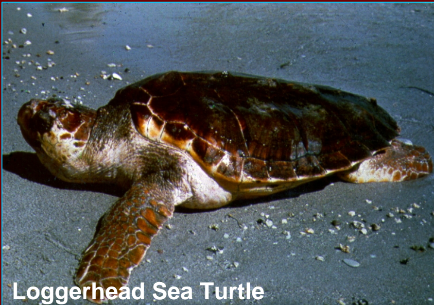
Loggerhead Sea Turtle