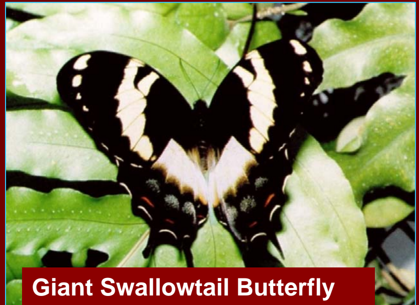
Giant Swallowtail Butterfly