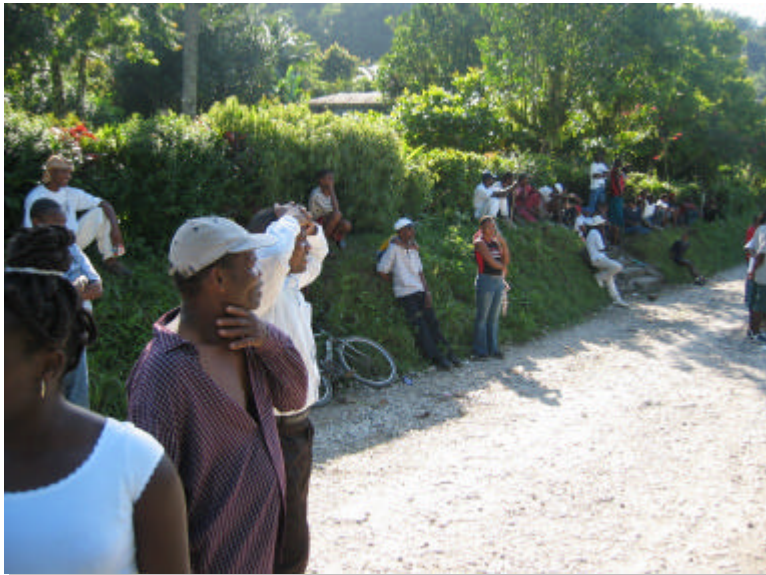
Spectators from Ginger House watching cricket in the shade