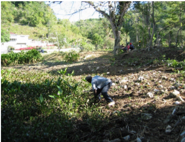
Chopping the grass