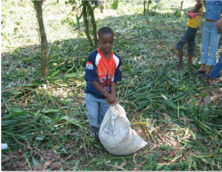
This bag is heavy I just have to drag it