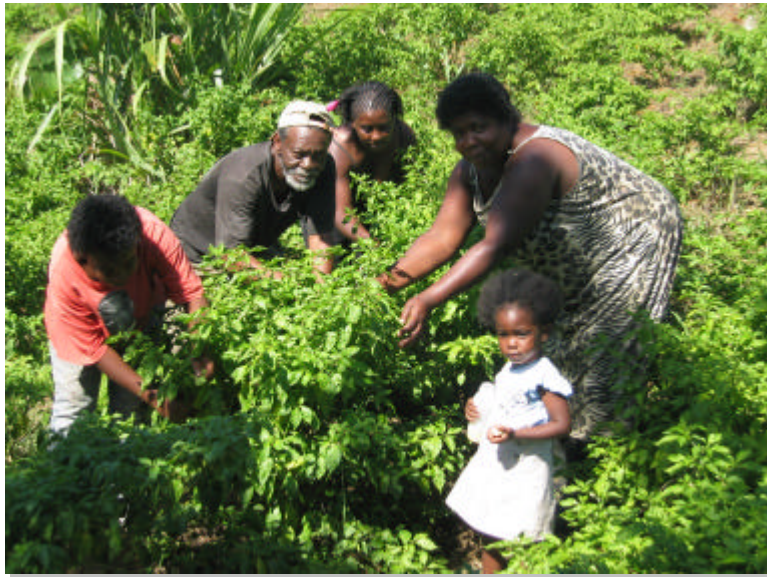
Everyone involved in picking peppers