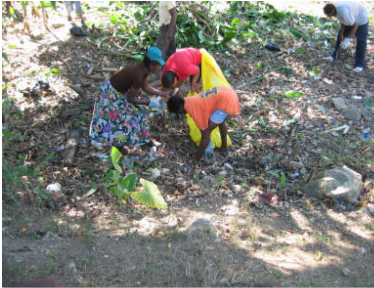
Picking up all the little paper and plastic out of the gravel