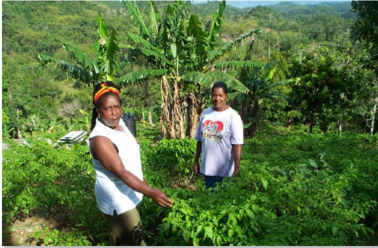
Ladies Picking Peppers