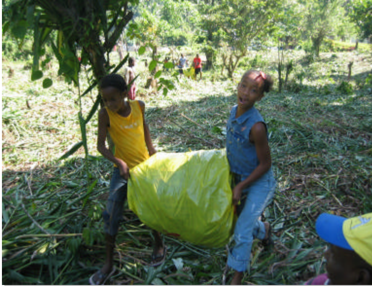
Boy and girl helping to dispose of garbage