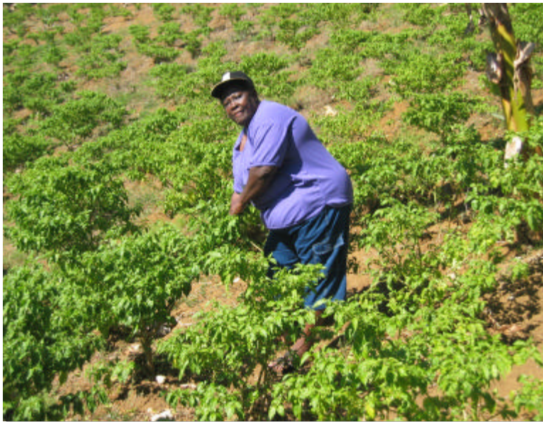
In the fields picking pepper