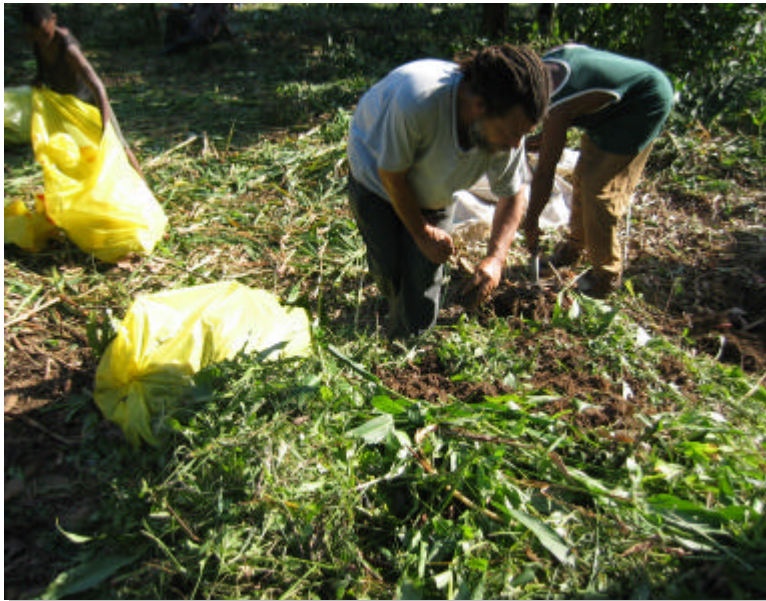
Weeding out the grass