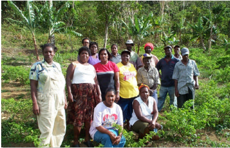
Group picture of Rushea Hot Pepper Team