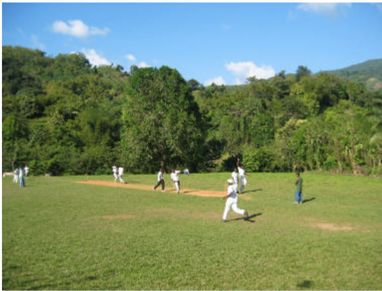
Cricket Lovely Cricket