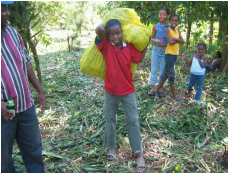
Taking the weight on my shoulder was the best idea