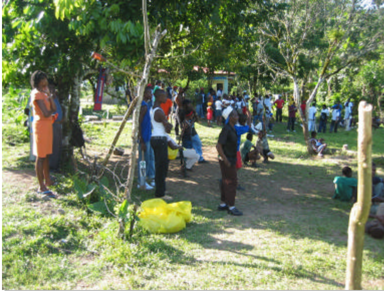
Residents relaxing and watching cricket