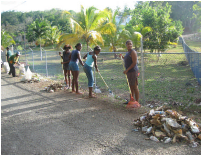
Look! How much work we have done girls