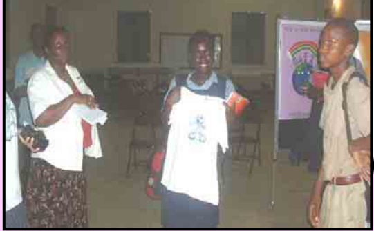
A student from STETHS happily displays her Ozzy Ozone T-shirt at the Ozone Day Exhibition held at the St Matthew's Anglican Church in Santa Cruz