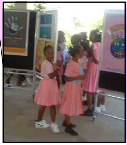
Students from St Elmo's Prep School view the Exhibition