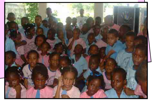
Students from St Elmo's Prep School watch the Ozzie Ozone video